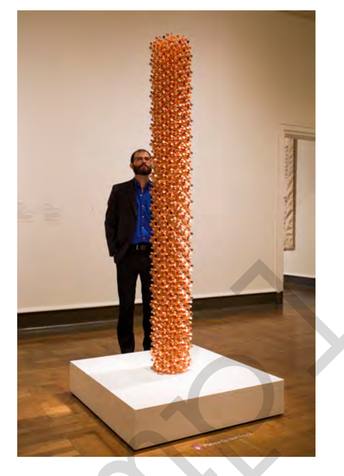
Figure 2 Robert Wechsler, The Caryatid , 2014. Installation view.