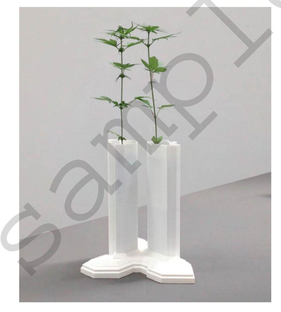
Figure 6 SUPERFLEX, Investment Bank Flowerpots/Deutsche Bank Cannabis Sativa , 2010. Image courtesy of the artist.

world of money ought to be the realm of disinterested, dispassionate and routine calculation, common perceptions of the depravities of finance points the finger at "greedy" individuals or corporations who game the system, at nefarious central banks that use fiscal necromancy to concoct money out of ether, or at a kind of actuarial wizardry. Financialization itself gives rise to a stunted political imagination that can only perceive the contradiction-driven structural and systemic crises of finance capital in a moralizing frame, blaming them on corrupt individuals who spin elaborate illusions to enrich themselves. The reality, as we shall see in the coming chapters, is much more complex, but we are extremely ill-served by the limiting notion that, essentially, the rational economy has been corrupted by a surplus of artfulness or "cultural" distortions.