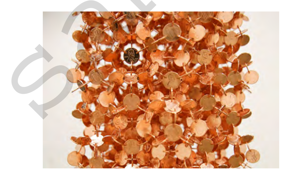
Figure 3 Robert Wechsler, The Caryatid , 2014. Detail.