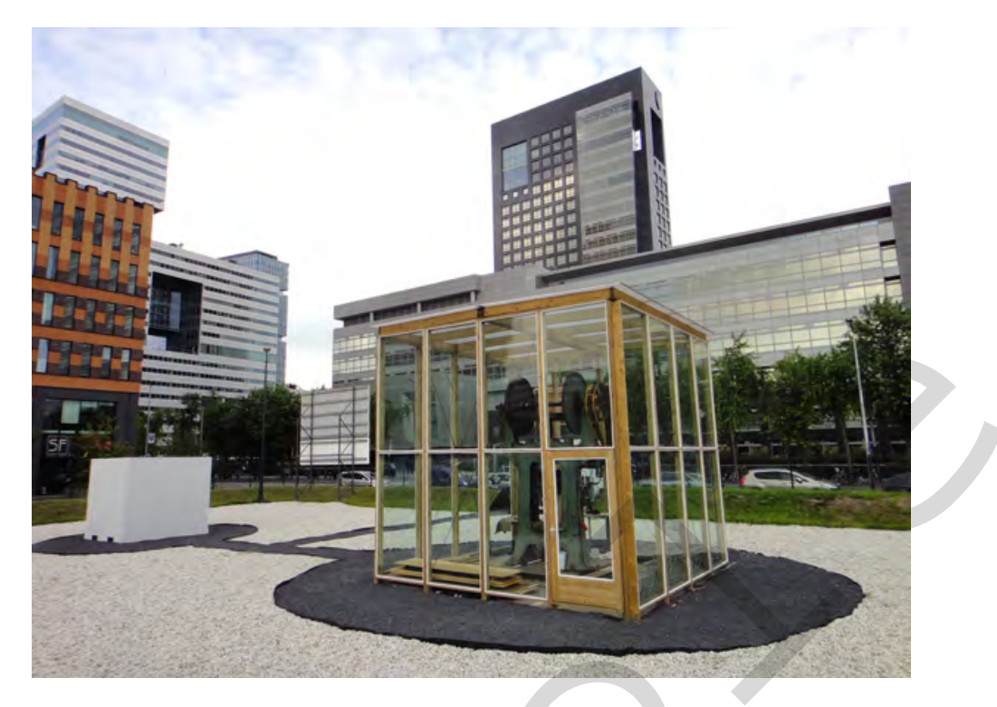
Figure 5 Art reserve bank installation view, Amsterdam.

tors can pool resources and ownership of works purely for speculative gain, new forms of collateralization and insurance, freeport art storage facilities to cache these treasures tax-free, new galleries, museums and discursive venues to legitimate this art and present it to wider publics, glitzy international art fairs and more.<sup>32</sup>