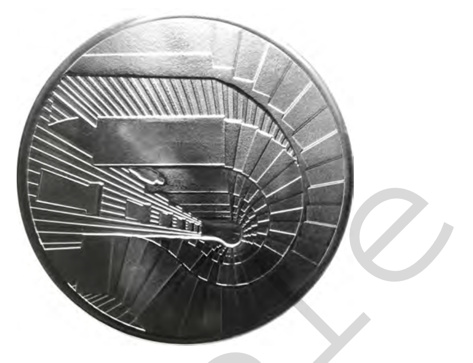
Figure 4 Art Reserve Bank coin designed by Gabriel Lester: "Shadow Economics."

The Art Reserve Bank (ARB) is a sophisticated yet mirthful cooperative venture that, from May 1, 2012 to April 29, 2017, engaged in an experiment to test the caliber of art as reserve of value. Over the five years, the bank, which was given special permission by the Dutch Central Bank, minted 25,000 coins designed by different artists and released weekly in editions of 100 (there being roughly 250 weeks in the five-year period, for a total of 25,000 coins). Coins could be purchased at an exchange rate set by the bank (it is and has always yet been €100) and, more importantly, sold back to the bank at any time at the current exchange rate plus 10 percent (non-compound) interest per year. In other words, if I were to have bought a coin for €100 in May of 2013, I could sell it back to the bank in June of 2015 for €120. In this sense, the coins were not so much units of currency but more like a token or a bond issued by the bank. But each coin was also a unique work of art, with its own economic value somehow also tied to its artistic value. The relationship between these values is precisely what the ARB was created to test.